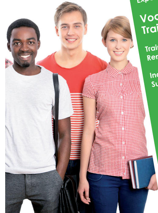
IBA/td_08-05-2013_Subject to change

*Expenses are funded by the German Government and German Trade & Industry for approximately 3 years.